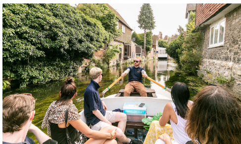
The River Stour

For further details and event listings go to canterbury.co.uk or visit Canterbury Visitor Information (located in The Beaney on the ground floor) or call them on 01227 862 162 .