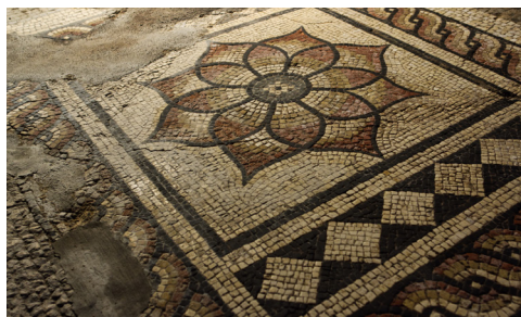
Canterbury Roman Museum