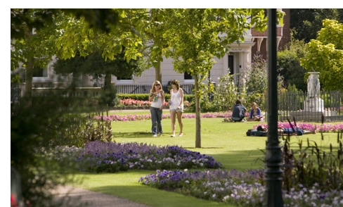
Dane John Gardens