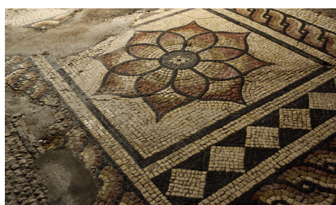
Canterbury Roman Museum