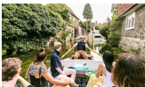
The River Stour

For further details and event listings go to canterbury.co.uk or visit Canterbury Visitor Information (located in The Beane on the ground floor) or call them on 01227 862 162 .