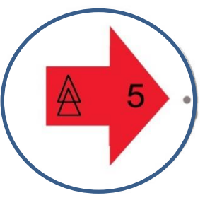
The sculpture trail is signposted clockwise in numerical order - posts 1-34 The trail is approx. 6 km / 3.5 miles long